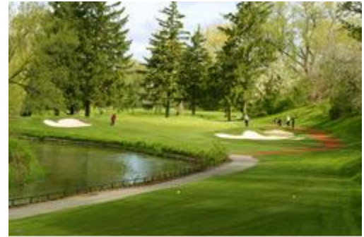
The 5th green on our historic Stanley Thompson designed course, one of two 18-hole courses featured at Sunningdale