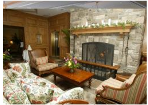
The Clubhouse Grand Foyer