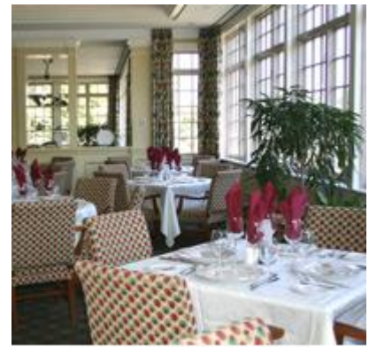
The Medway Room offers beautiful views of the Medway Valley

Choose from our selection of tempting desserts.