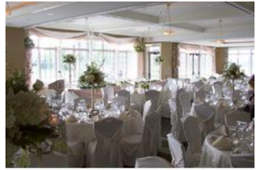
The Thompson Banquet Hall decorated for a wedding reception